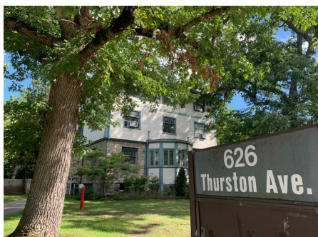
626 Thurston, home of the LGBT Resource Center