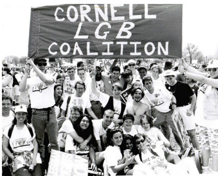
National March on Washington for LGB Rights.